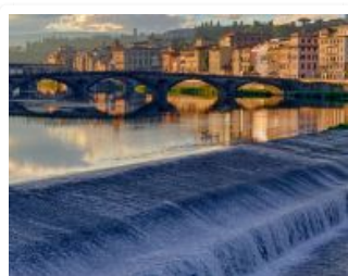
Class B - 2nd Place Maurice Hirsch - Arno Morning