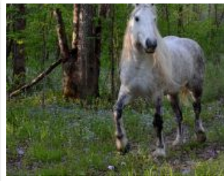
Class Salon - HM Carolyn Schlueter - Freedom on the Farm