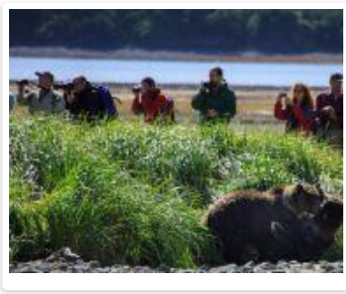
Class A - 1st Place