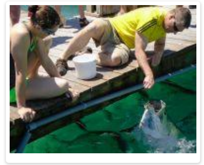
Class A - HM