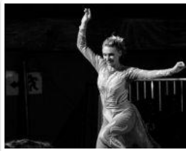
Class B - HM