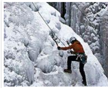
Class Salon - 1st Place

Kathleen O'Donnell - Climbing Ice In Colorado