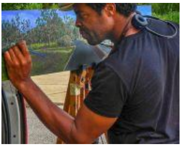
Class B - 2nd Place