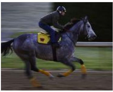
Class B - HM