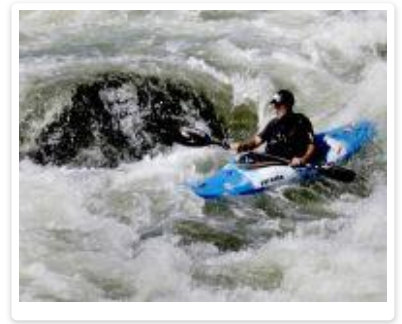
Class B - 1st Place