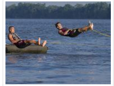
Class B - HM