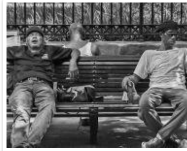
Class B - HM