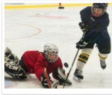
Class A - HM