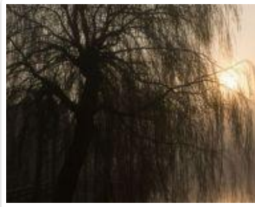
Class B - 3rd Place