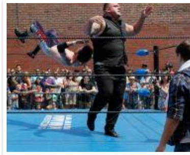
Class B - HM