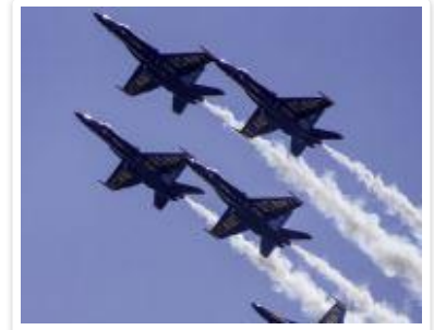
Class B - HM